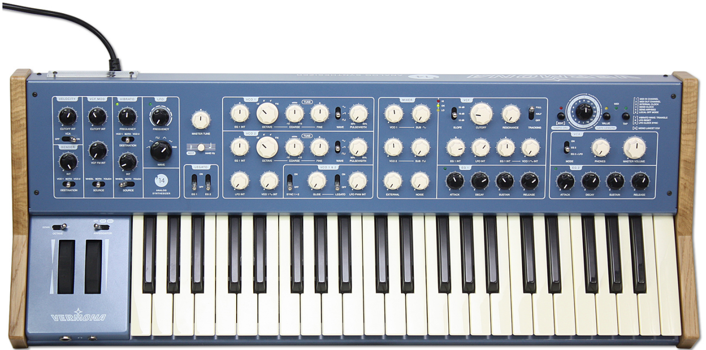
The keys on our model have yellowed somewhat over the years. In 2025, we therefore replaced the original polar white knob heads with cream-colored ones. Now the synthesizer looks homogeneous again.

We have attached 50 minutes of audio-files. Enjoy listening!