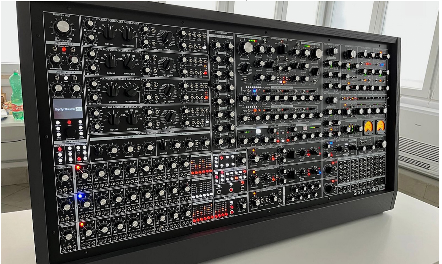
GRP A10