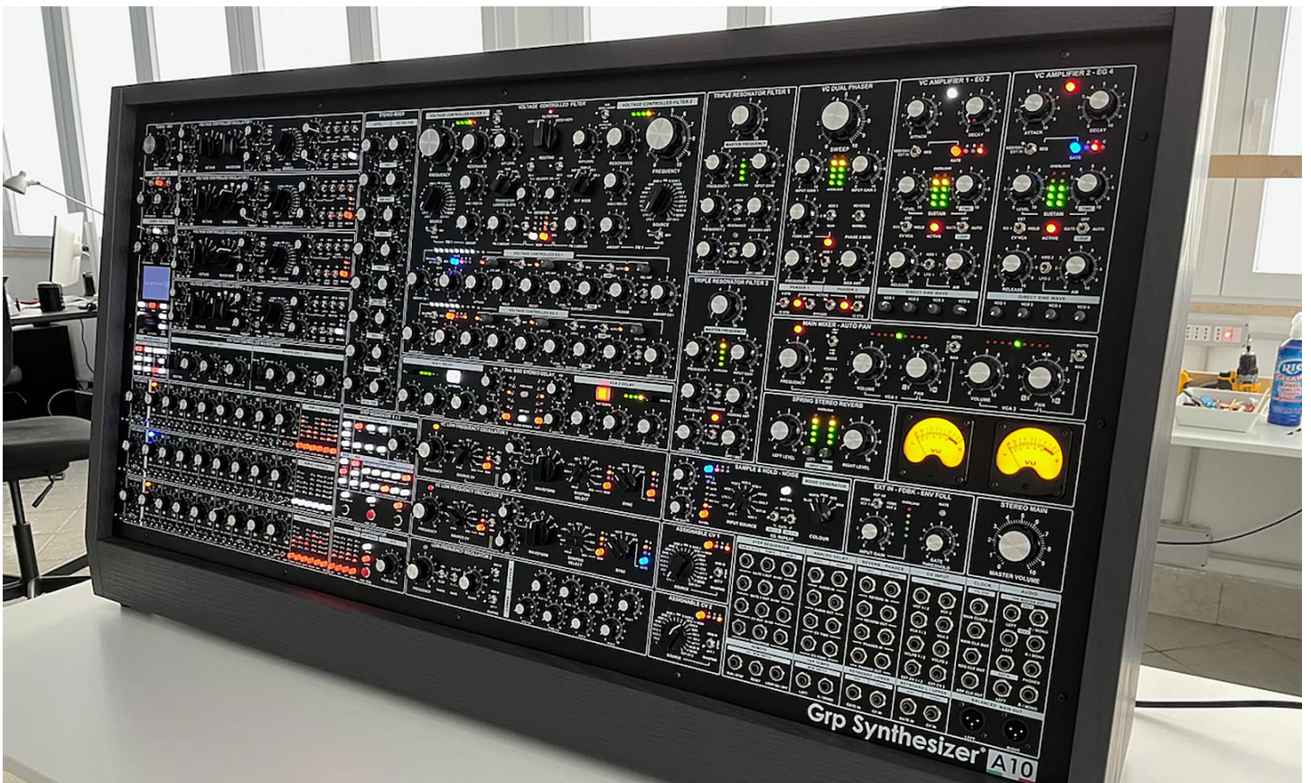
GRP A10